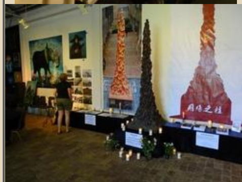
Galleri Galschiøt mark the 30 th anniversary of the Tiananmen massacre