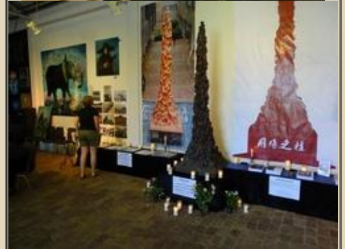
Galleri Galschiøt mark the 30 th anniversary of the Tiananmen massacre

newsletter about the case or this website